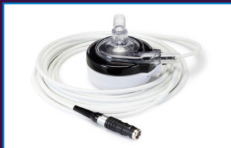
LIFESPARC™ PUMP & ACCESSORIES